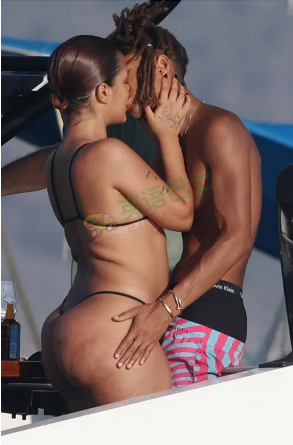
At one point, he squeezed the 23-year-old ' s bum while leaning in for another embrace,