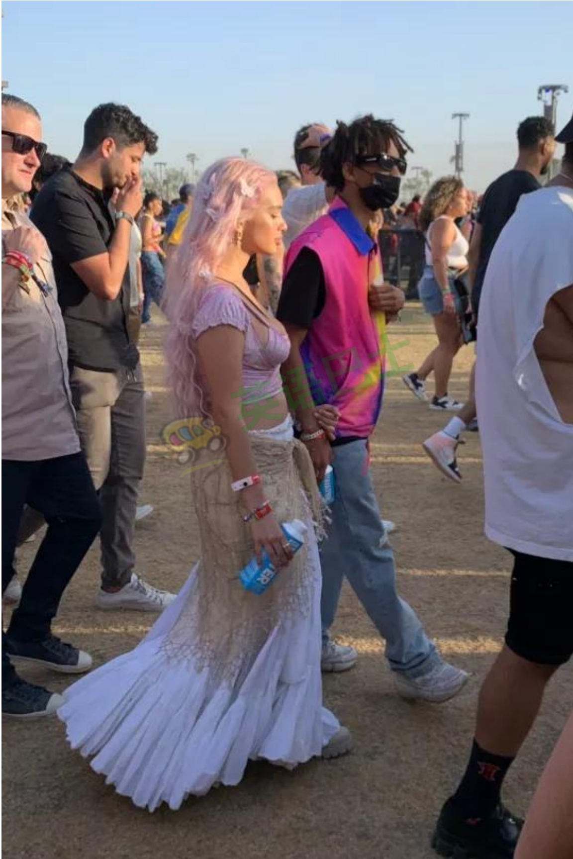
Jaden Smith was spotted arriving at Coachella at that time hand-in-hand with his